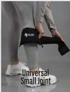
Universal Small Joint