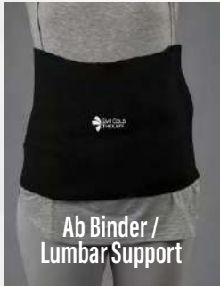
Ab Binder / Lumbar Support

The Longest-Lasting Wrap and gel bag system that provides continuous, safe cold therapy.