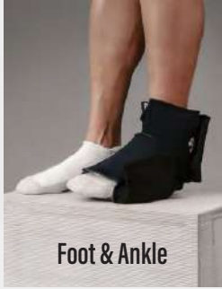
Foot & Ankle