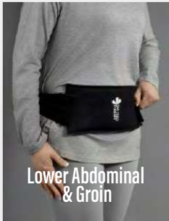
Lower Abdominal & Groin